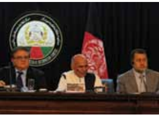
Dr. Ghani, chairman of the Islamic Republic of Afghanistan Transition Coordination Commission, Minister of Defence Wardak, (left), and Minister of Interior Mohammadi, (right), answer questions following a two-day Transition conference, June 2011.