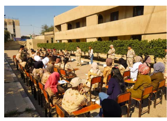
NATO Mission Iraq Gender Advisor presents during a Code of Conduct and Harassment Course in Baghdad area.