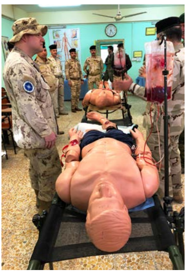
NATO Mission Iraq medical advisors are supporting the Iraqi Department of Military Medical Affairs in further developing military medical instruction.