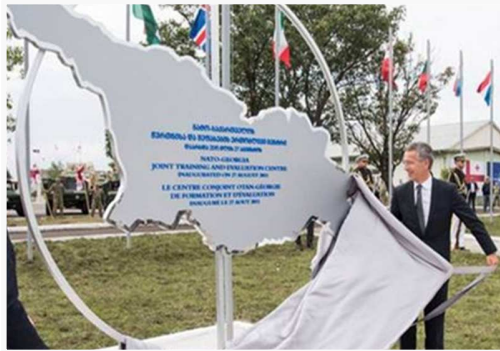
Secretary General Jens Stoltenberg opens the Joint Training and Evaluation Centre on 27 August 2015.