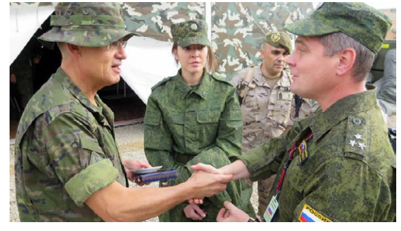
Russian observers visit NATO Trident Juncture 2015 exercise.

In the current security context, NATO will continue to focus on deterrence and defence, while remaining open to a periodic, focused and meaningful dialogue with Russia. That is why two meetings of the NATO-Russia