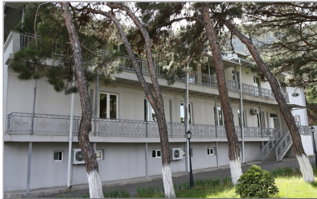
The Defence Institution Building School, Tbilisi