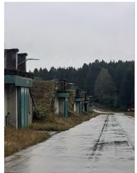
MAWI Belgium pilot stockpiling solution

Based on a Belgian initiative, a group of Allies and partners thoroughly explored the feasibility and practicalities associated with creating various types of multinational solutions for warehousing munitions underneath a single set of operational principles. The MAWI framework was then formally established through the signature of a memorandum of understanding (MOU) by participants' Defence Ministers in the margins of the NATO Summit in June 2021.