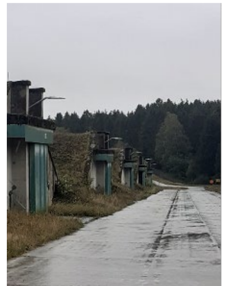
Potential MAWI stockpiling solution in Belgium

Based on a Belgian initiative, a group of Allies and partners thoroughly explored the feasibility and practicalities associated with creating various types of multinational solutions for warehousing munitions underneath a single set of operational principles. The MAWI framework was then formally established through the signature of a memorandum of understanding (MOU) by participants' Defence Ministers in the margins of the NATO Summit in June 2021.