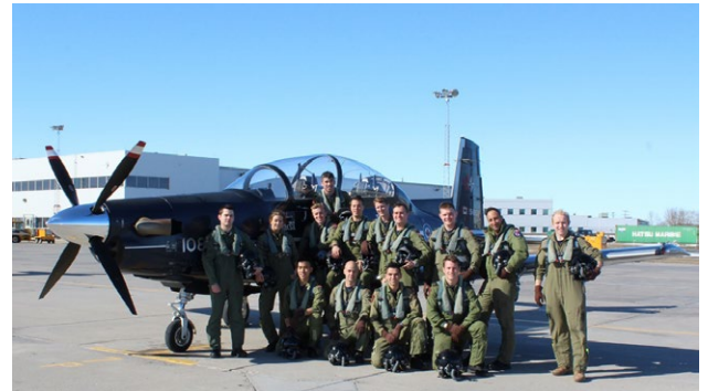
Students of the NATO Flight Training in Canada (NFTC), which inspired the creation of the NFTE

The NATO Flight Training Europe (NFTE) High Visibility Project 3 will be a network of training campuses set up for different types of pilots: fighter jet pilots, helicopter and transport pilots, as well as personnel who remotely pilot aircraft. This multinational initiative will enable adaptable pilot training across Europe, using existing training structures whenever possible. The participating nations are: Belgium, the Czech Republic, Greece, Hungary, Italy, Montenegro, North Macedonia, Romania, Spain and Turkey.