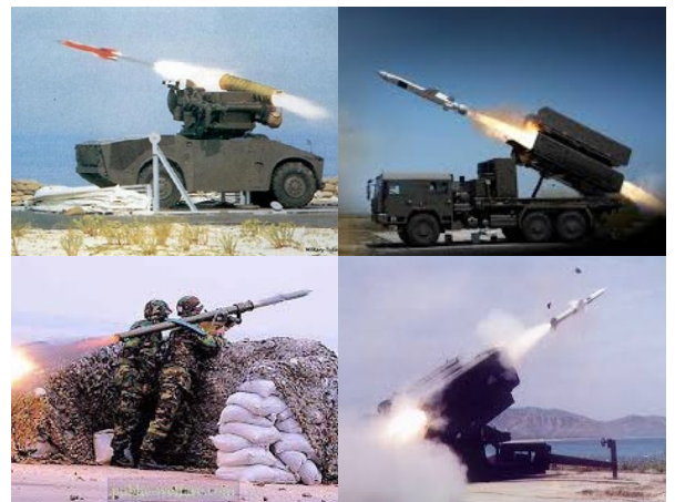
Very short-range, short-range and medium-range systems currently in use. From left to right: Crotale (France), NASAMS (Norway), Stinger (United States) and SPADA (Italy).

Following further analysis and negotiations, Belgium, Denmark, Germany, Hungary, Italy, Latvia, the Netherlands, Slovenia, Spain and the United Kingdom launched the multinational Modular GBAD High Visibility Project through the signature of a Letter of Intent in the margins of the October 2020 Defence Ministers Meeting. Following the signature of the Letter of Intent, the 10 participating Allies started working on the development of a detailed set of common requirements and a corresponding Memorandum of Understanding. The latter will provide the legal basis for the potential development and procurement of the actual modular GBAD capability.