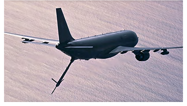
Airbus A330 Multi Role Tanker Transport aircraft.

This multinational fleet arrangement is a cost-effective and flexible solution, reducing the European shortage in AAR capabilities and the reliance on U.S. capabilities. The project demonstrates the deepening cooperation between NATO and the European Union in delivering critical capabilities.