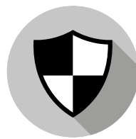
Network of Defence Education Institutions