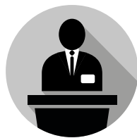
Subject Matter Experts