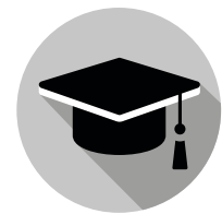
Faculty and Instructors