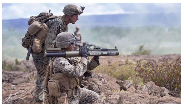
Soldier using anti-tank weapon.

The LBDM project aims to increase flexibility in stockpile management by decreasing legal and technical constraints for participants to exchange munition. It was launched in June 2017 by 11 Allies and NATO partner Finland during a Defence Ministerial Meeting (DMM) when a Letter of Intent (LoI) was signed. At the 2018 NATO Summit held in Brussels on 11-12 July, a Memorandum of Understanding between 16 Allies and 3 partners was signed.