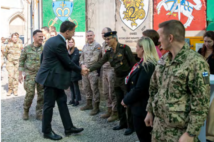
NATO Secretary General Mark Rutte visits Iraq (February 2025)