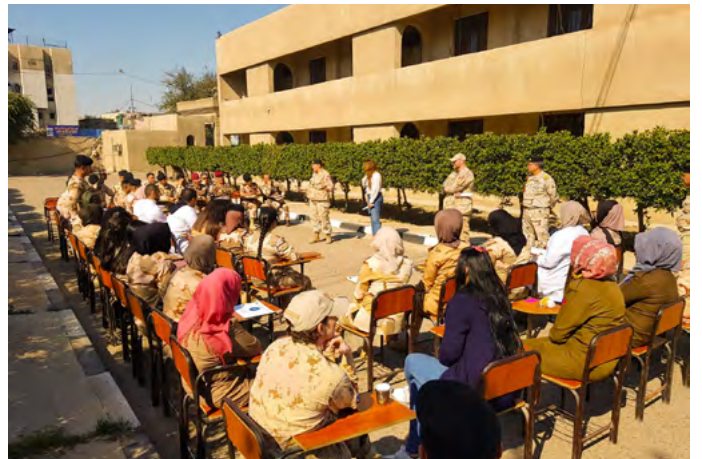
NATO Mission Iraq Gender Advisor presents during a Code of Conduct and Harassment Course in Baghdad area (2019)