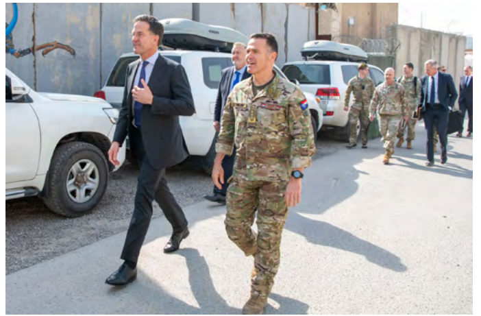
NATO Secretary General Mark Rutte visits Iraq (February 2025)