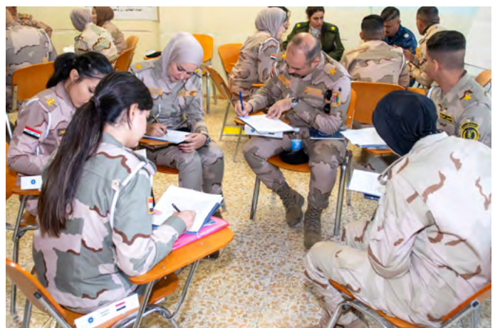
Iraqi military personnel attends Medical school workshop (2023)