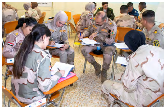
Iraqi military personnel attends Medical school workshop (2023)