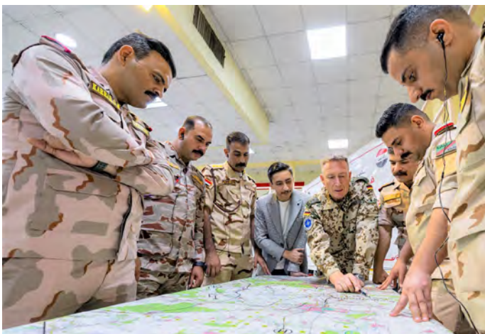
Combined Arms Training Course (CAT-C), May-June 2024