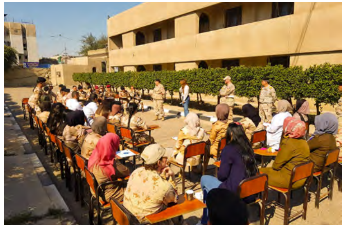
NATO Mission Iraq Gender Advisor presents during a Code of Conduct and Harassment Course in Baghdad area (2019)