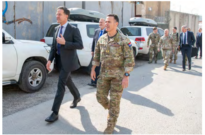
NATO Secretary General Mark Rutte visits Iraq (February 2025)