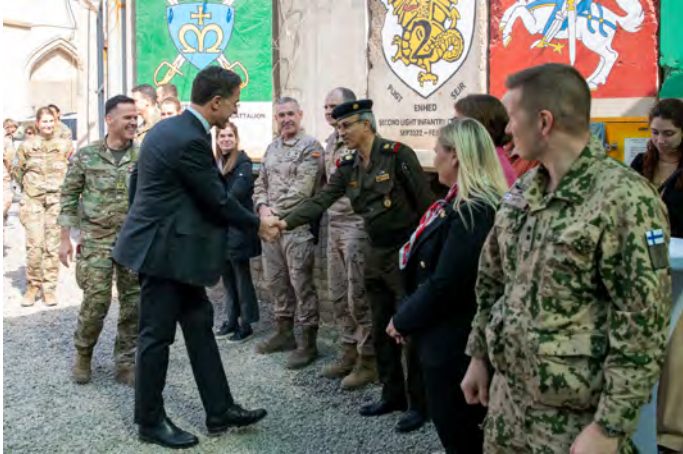
NATO Secretary General Mark Rutte visits Iraq (February 2025)