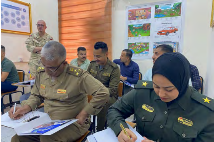
English language course