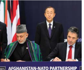
LISBOA, 20 XI 2010