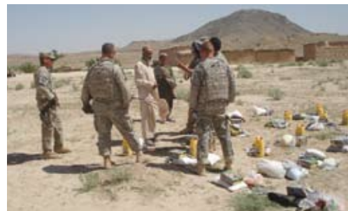
Zabul PRT personnel and 101st Airborne Division soldiers speak with village elders from Bowlan Kalay and prepare to hand out humanitarian aid supplies.

The IMS is also responsible for planning, assessing and recommending policy on military matters for consideration by the Military Committee, and for ensuring their policies and decisions are implemented as directed. This staff is the essential link between the decision-making bodies of the Alliance, the two Strategic Commanders, national military delegations from NATO and Partner countries working in Brussels, and the civilian International Staff that support the Secretary General and the North Atlantic Council.