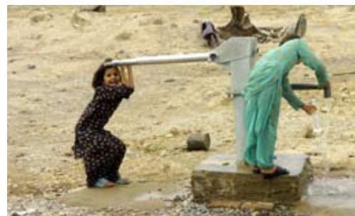
Afghan children from the village of Sayad Pacha in southern Afghanistan, use a water pump funded by the military's civil-military cooperation section.