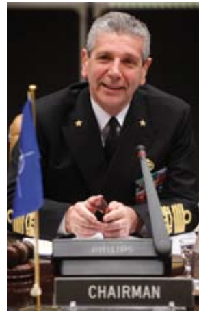
Italian Admiral Giampaolo Di Paola, current chairman of the Military Committee, is the most senior authority of the Alliance. Nominated by NATO's Chiefs of Defence, he chairs all the meetings of the Committee and acts in an international capacity. NATO's chiefs of defence meet at least three times a year, and on a day-to-day basis work through permanent military representatives in NATO HQ in Brussels.