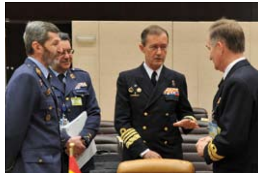
The Committee's principal role is to provide direction and advice on military policy and strategy. It is responsible for recommending to NATO's political authorities those measures considered necessary for the common defence of the NATO area and for the implementation of decisions regarding NATO's operations and missions.