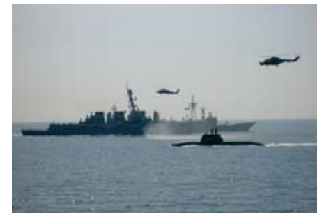
Operation Active Endeavour is NATO's maritime surveillance and escort operation in the fight against terrorism. Based in the Mediterranean Sea, the force, which is provided by several nations, including for a time by Russia and Ukraine, has hailed more than 100,000 vessels.